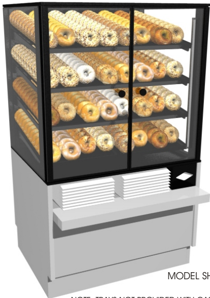
MODEL SHOWN: CSF4231