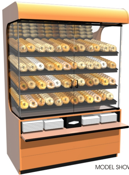
MODEL SHOWN: PC5682

NOTE: SHOWN W/CUTAWAY END PANEL OPTION. TRAYS NOT PROVIDED