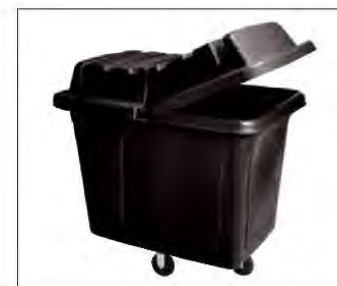
4612 / 4613