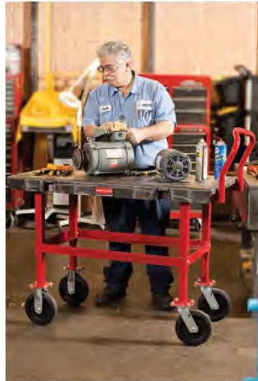
WORK-HEIGHT PLATFORM TRUCK