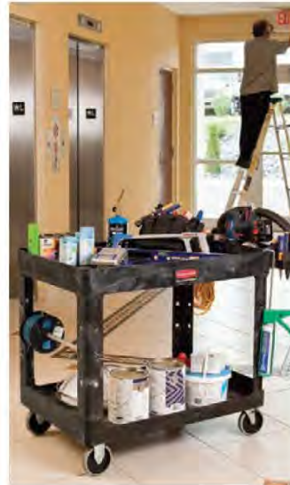
HEAVY-DUTY UTILITY CART