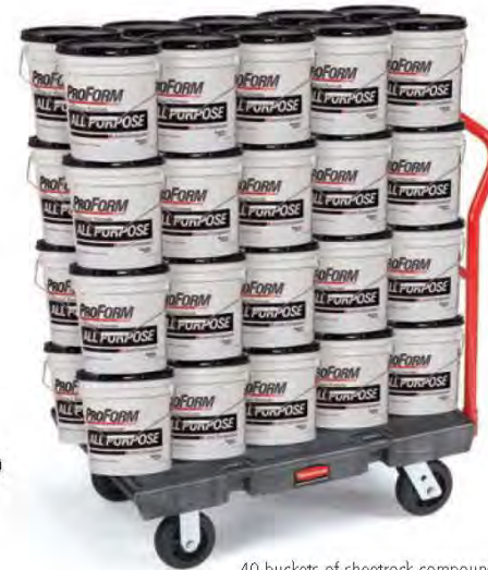
40 buckets of sheetrock compound weighs over 2,400 lbs—that's a load!

Rubbermaid's exclusive Duramold™ technology exceeds the highest performance standards in the industry. We test and retest our products to meet rigorous durability standards, and our new material handling products are no exception. Real-world rugged durability, innovative technology, and best-in-class features combine to create longer lasting products that carry heavy loads—and make your work easier.