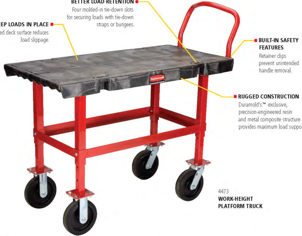
4473 WORK-HEIGHT PLATFORM TRUCK

RUGGED CONSTRUCTION Duramold's™ exclusive, precision-engineered resin and metal composite structure provides maximum load support.