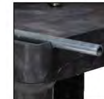
4520-88 HEAVY-DUTY UTILITY CART

V-notch holds pipe securely for safe cutting.