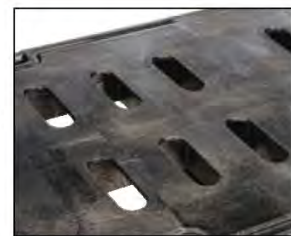
4490 DUNNAGE RACK

Duramold's™ exclusive, precision-engineered resin and metal composite structure provides maximum load support.