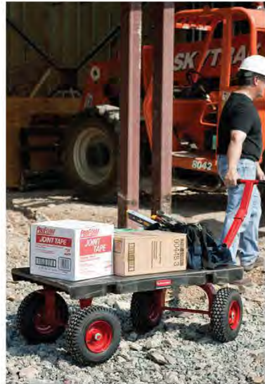
5 TH WHEEL WAGON TRUCK

From our redesigned Platform Trucks and Utility Carts , and new 5 th Wheel Wagon Truck and Work-Height Platform Truck , to our patent-pending Convertible A-Frame and Convertible Platform Trucks , we're your source for material handling products that meet your needs in almost every environment and application.