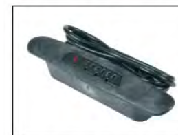
4590 3-OUTLET POWER STRIP