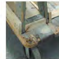
Wood—splinters and rots