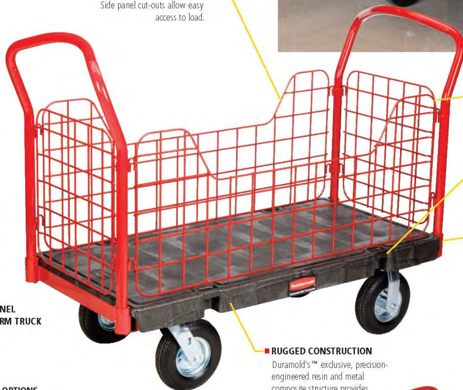
4486 SIDE PANEL PLATFORM TRUCK

ENHANCE USER COMFORT Side panel cut-outs allow easy access to load.