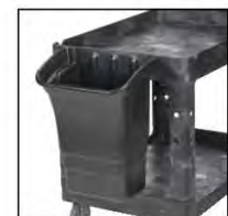
3353-88 8 GAL REFUSE BIN