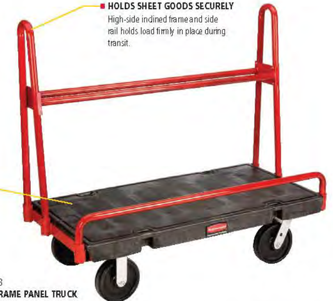
4463 A-FRAME PANEL TRUCK

HOLDS SHEET GOODS SECURELY High-side inclined frame and side rail holds load firmly in place during transit.