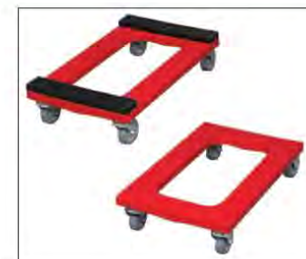
9T54 / 9T55