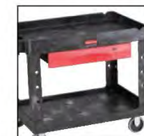
4593 SINGLE FULL EXTENSION DRAWER