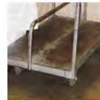
Metal—dents and rusts

Tough, resilient surface absorbs impact and provides quiet operation. Virtually maintenance-free: resistant to most chemicals, impervious to water damage, and is easily cleaned.