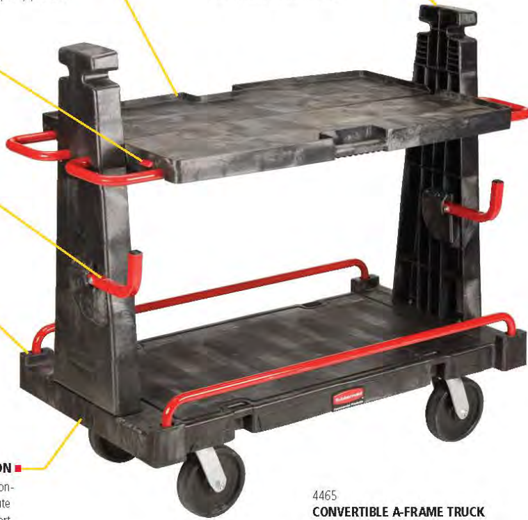
4465 CONVERTIBLE A-FRAME TRUCK

Duramold's™ exclusive, precision-engineered resin and metal composite structure provides maximum load support.