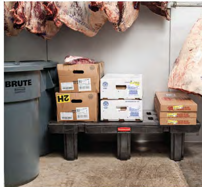
4494 SEMI-LIVE SKID

Molded-in tie-down slots increase load security. Textured deck surface reduces load slippage.