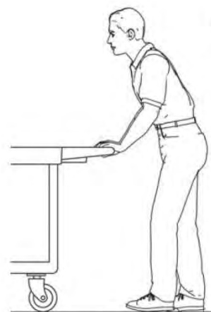
TRADITIONAL CART HANDLE DESIGN