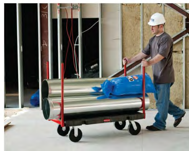
4482 STANCHION PLATFORM TRUCK

RUGGED CONSTRUCTION Duramold's™ exclusive, precision-engineered resin and metal composite structure provides maximum load support.