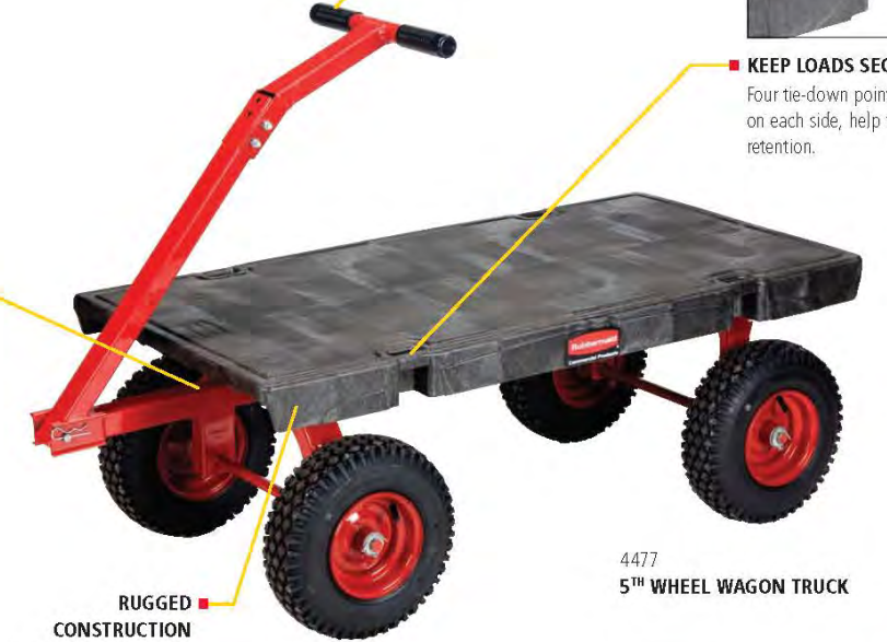
4477 5 TH WHEEL WAGON TRUCK

KEEP LOADS SECURE Four tie-down points, two on each side, help with load retention.