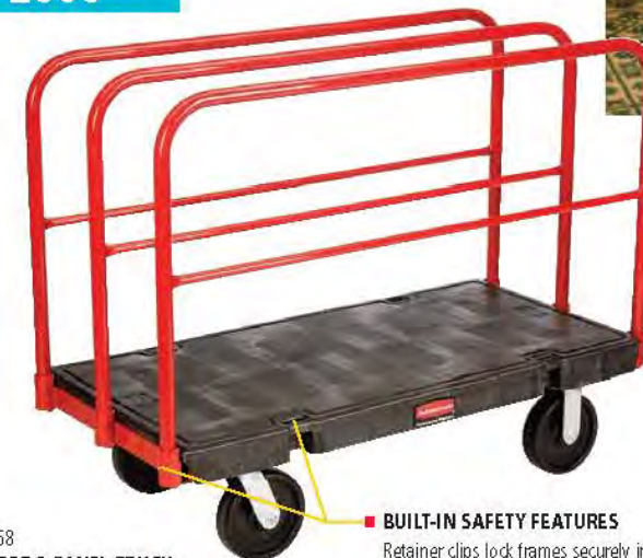
4468 SHEET & PANEL TRUCK

BUILT-IN SAFETY FEATURES Retainer clips lock frames securely in place and prevent unintended removal. Four tie-down points, two on each side, help with load retention.