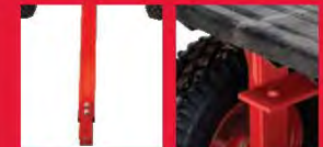
Clevis Pin Rear Tow Hitch