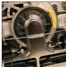
No tools required access to sturdy Lexan fan