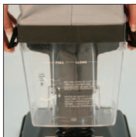
127DC-Easy to empty dirt cup