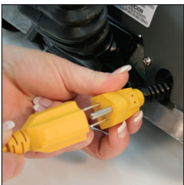
Pigtail electrical cord for easy replacement