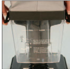
128DC-Easy to empty dirt cup