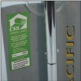
128G-Carpet & Rug Institute Green Label Approved