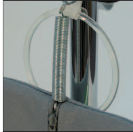
Spare onboard poly belt