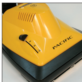
Variable height settings