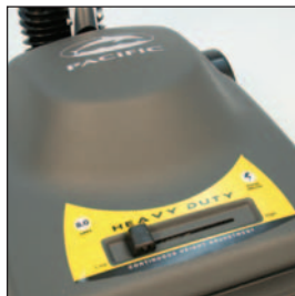
Variable height settings