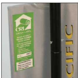
127G-Carpet & Rug Institute Green Label Approved