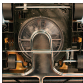
No tools required access to sturdy Lexan fan