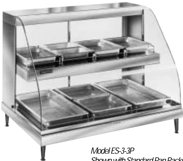
Model ES-3-3P Shown with Standard Pan Racks (pans optional)

The ultimate in countertop hot food merchandising! Up to the minute styling with traditional Merco efficiency and quality.