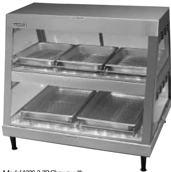
Model 1220-2-3P Shown with Standard Pan Racks (pans are optional)

Holds more food longer in less space! Ideal for cafeterias, delicatessens, markets, convenience stores, etc.