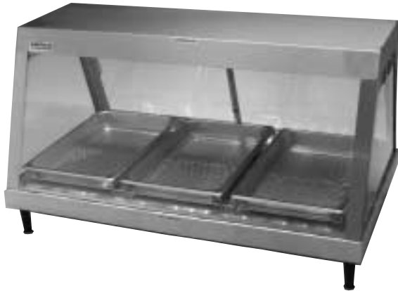
Model 1220-3P Shown with Standard Pan Rack (pans are optional)

Holds in the goodness without continued cooking or drying. Ideal for chicken, fish, ribs, french fries, biscuits, etc.