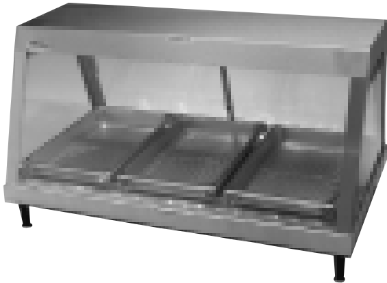
Model 1220-3P Shown with Standard Pan Rack (pans are optional)

Holds in the goodness without continued cooking or drying. Ideal for chicken, fish, ribs, french fries, biscuits, etc.