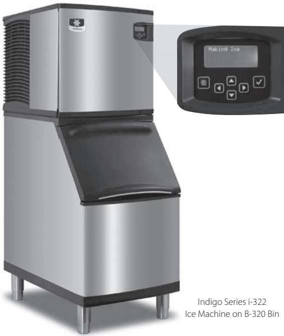
Indigo Series i-322 Ice Machine on B-320 Bin

Designed for operators who know that ice is critical to their business, the Indigo™ Series ice machine's preventative diagnostics continually monitor itself for reliable ice production. Improvements in cleanability and programmability make your ice machine easy to own and less expensive to operate.