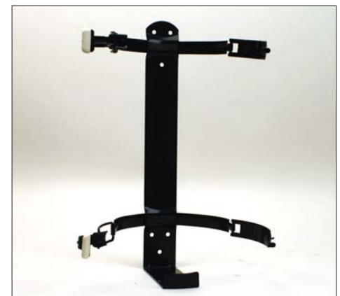
SF-024 Double Strap

Strike First also offers a Medium Duty Double Strap Vehicle Bracket for use with all 5lb and 10lb ABC fire extinguishers. Polyester powder coat finish. Heavy duty buckle closures.