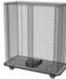
Standard Electric Thermal System