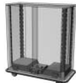
Quad-Heat™ Dual Fuel Thermal System