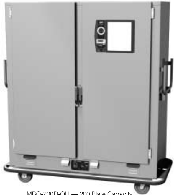
MBQ-200D-QH — 200 Plate Capacity with Quad-Heat™ Dual Fuel