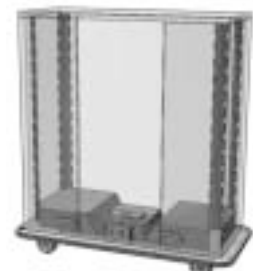
Quad-Heat™ Dual Fuel Thermal System