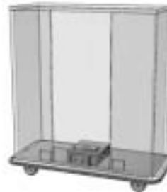
Standard Electric Thermal System