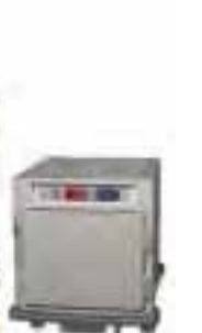
Under Counter Full Solid Door