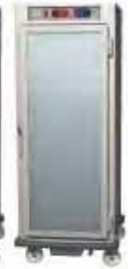
Full Height Full Clear Door