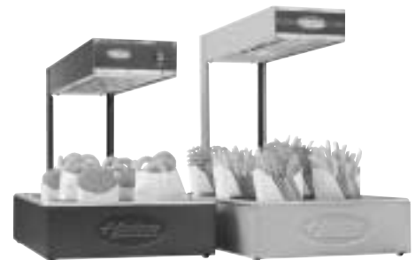
Models GRFF and GRFFC with optional Designer colors, accessory food pans and hardcoated fry ribbons