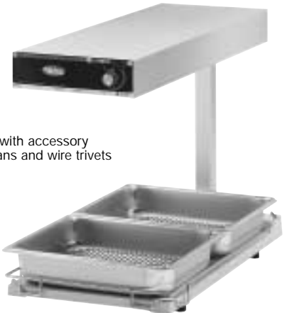
Model GRFFBL with accessory half-size food pans and wire trivets