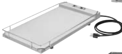
Model GR-B Heated Base