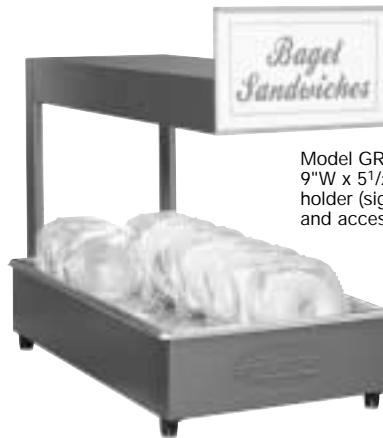
Model GRFFL with optional 9"W x 5 1/2"H (23 x 14 cm) display sign holder (sign not included), Designer color and accessory food pan