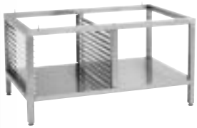
CST-20-OB with CST-20-R (Pan Racks)