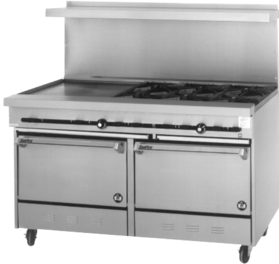
Model S-24G-6-2626 shown with optional casters