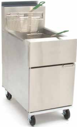
SR62G Shown with optional casters.