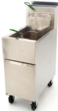
SR52G Shown with optional casters.