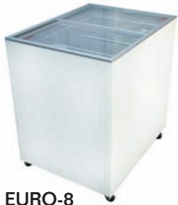
EURO-8 (Shown with optional baskets)