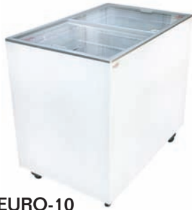
EURO-10 (Shown with optional baskets)