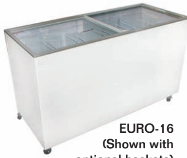
EURO-16 (Shown with optional baskets)