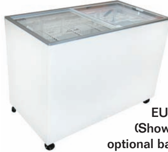
EURO-13 (Shown with optional baskets)