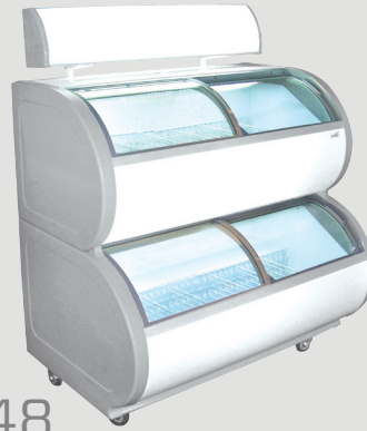
DS 48 (Shown with optional light bar)