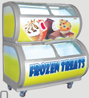
DS 30 (Shown with optional graphics)