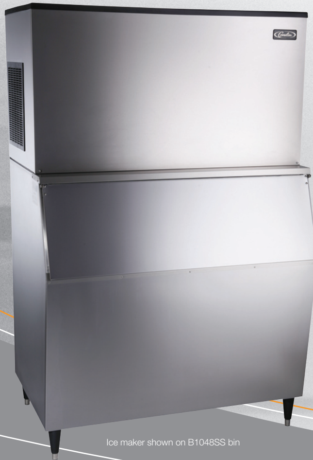
Ice maker shown on B1048SS bin