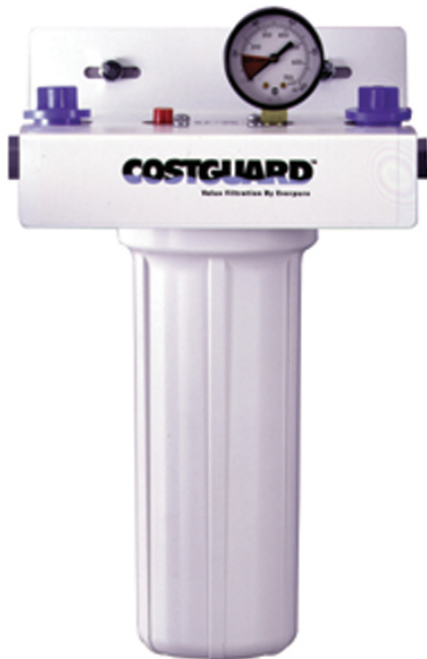
CGS-10 10" Single Housing: DEV9100-10