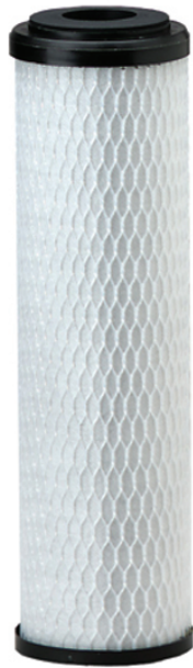
CG5-10S Replacement Cartridge: DEV9108-17