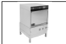
Optional pedestal allows the L-1X to be raised up to a full 12" off the floor for easy operator use. Height adjustable from 8" to 12".