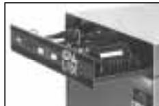
Convenient to service "Works-in-a-drawer", may be removed by unplugging one electrical connection.