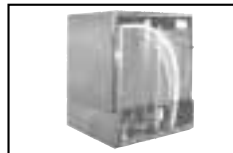
Pumped drain will drain uphill. Requires no floor drain.