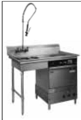
Optional dishtable, faucet and pre-rinse unit sold separately.