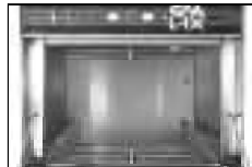
Upper and lower rotating wash arms guarantee excellent results.