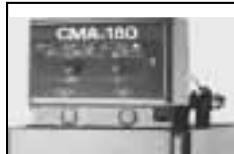
Top mounted control box is water tight and includes a rack counter, extended wash/delimer switch and easy to read temperature gauges.