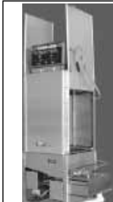
Large 27" door opening accommodates larger items and utensils.