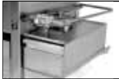
External scrap tray maintains clean wash water and prevents debris from clogging the drain.