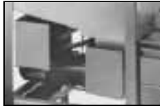
Industrial wash tank and optional booster heaters are designed for years of trouble free service.