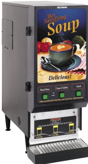
FMDS-3 front display panel

Dimensions: 30"H x 11.3"W x 23.3"D (76.2 cm H x 28.7 cm W x 59.2 cm D)