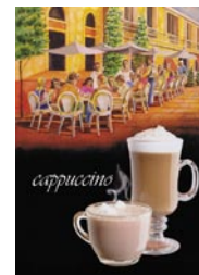
Model FMD-3 available with optional Cafe Display

Dimensions: 30"H x 11.3"W x 23.3"D (76.2 cm H x 28.7 cm W x 59.2 cm D)