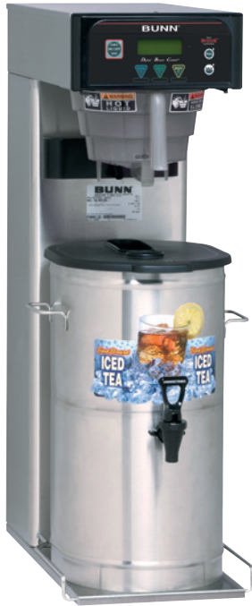
Model ITB with TDO-4 Dispenser (TDO-4 sold separately)

Dimensions (29" trunk): 34" H x 11.6" W x 22"D (86.4cm H x 29.5cm W x 58.4cm D)