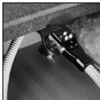
Premium quality 5-button, post-mix soda gun by Wunder-Bar ® with fast, low foaming delivery.