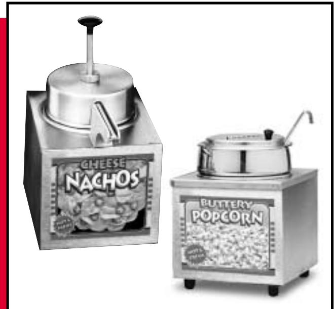
Nacho Cheese Pump and Hot Butter Warmer