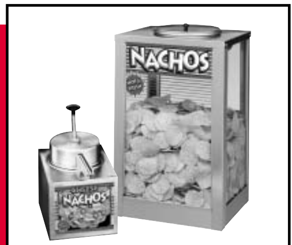
Nacho Cheese Pump with Nacho Cabinet