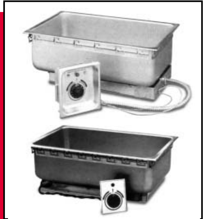
Top Mount Hot Food Well