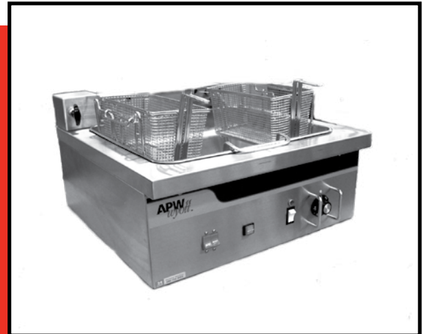
EF-30NT Countertop Electric Fryer