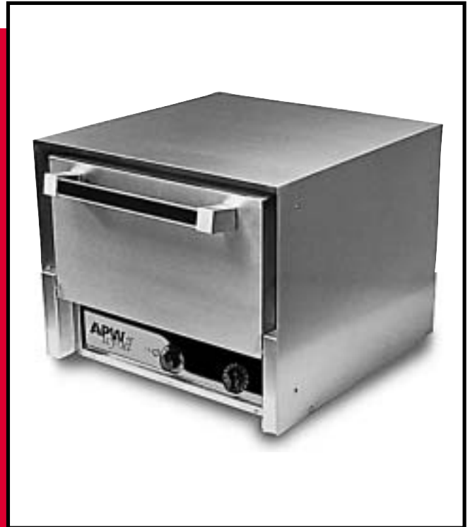
Counter Deck Oven