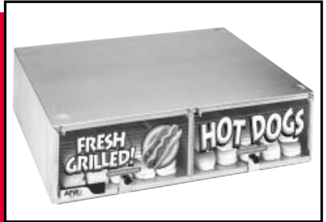
MODEL BC 31