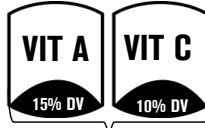
SUGGESTED OPTIONAL ICONS