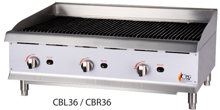
CBL36 / CBR36