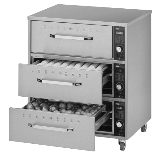
Model HDW-3 with optional casters