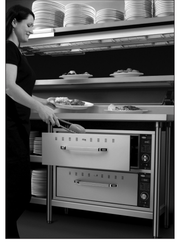
Model HDW-2 with optional stainless steel legs