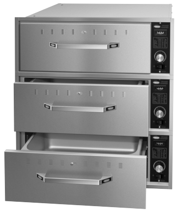
Model HDW-3B built-in