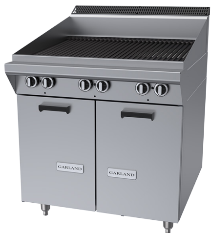
Model M34B Shown with optional backguard