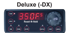
Deluxe Controls are available with 18 programmable menus and 6" meat probe.