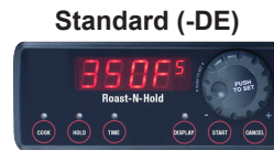
All Ovens come standard with easy-to-read and operate LED digital controls.