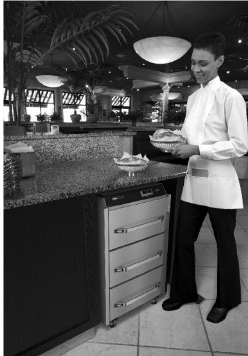
Model CDW-3N with low profile casters