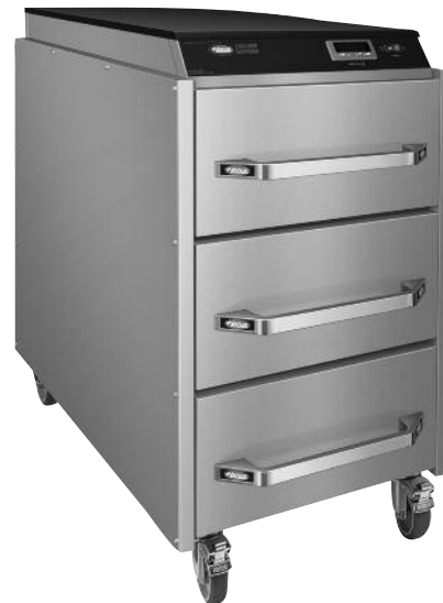
Model CDW-3N with low profile casters

METAL SHEATHED HEATING ELEMENTS GUARANTEED AGAINST BURNOUT AND BREAKAGE FOR TWO YEARS.