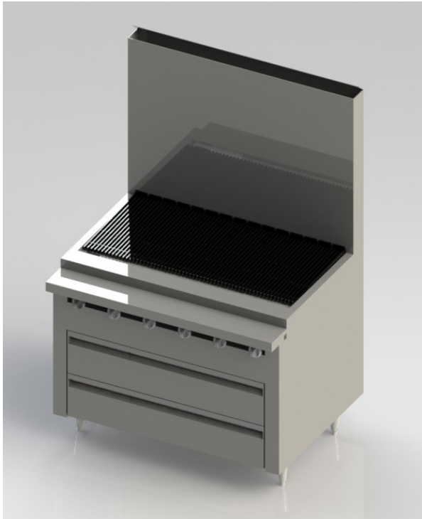
BRLH-02R-B-36 shown with BR-36B-M 36" Modular Base Charbroiler

Base Units for Use Under CAFE Modular Ranges