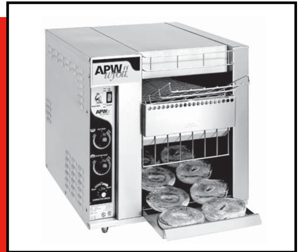
MODEL BT-15-2 CONVEYOR TOASTER