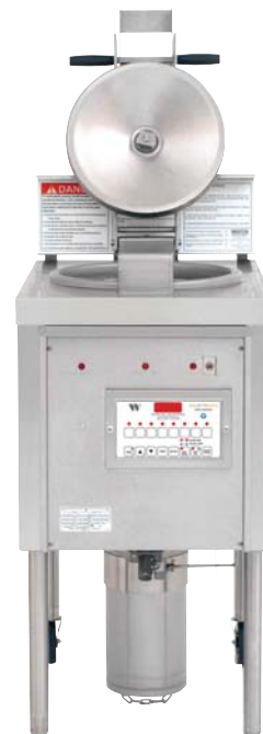
LP46 & LP56 COLLECTRAMATIC® HIGH EFFICIENCY FRYER 8-Channel Programmable Control

Built to comply with applicable standards for manufacturers. Included are UL, C-UL, UL Sanitation, DEMKO, CE, and MEA.