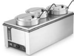
72050 with 19188 Adaptor Plate, 78184 Insets and 47488 Covers.