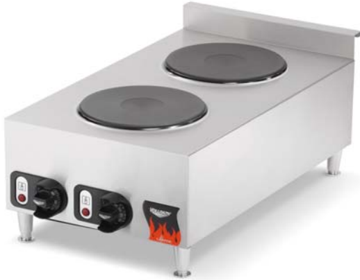
Cayenne® Electric Hot Plate