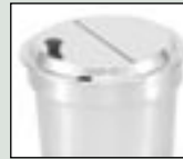
Hinged Covers See Page 1-22