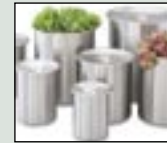
Bain Maries See Page 1-22