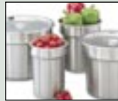
Insets See Page 1-22

Adaptor plates work in conjunction with a wide variety of Vollrath's accessories.