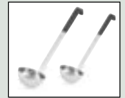
Heavy-Duty Ladles See Page 3-10