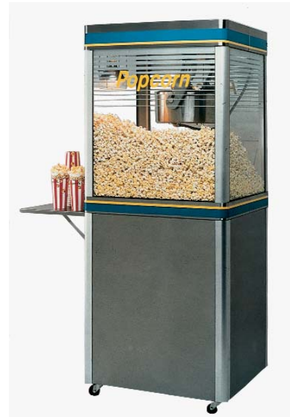
Model G14-Y (14 oz) & G18-Y (18 oz)