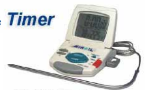
MTT Digital Frying Thermometer & Timer