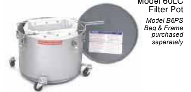
Model 60LC Filter Pot Model B6PS Bag & Frame purchased separately

For filtering and safer handling of hot oil Low profile to fit under drain valves