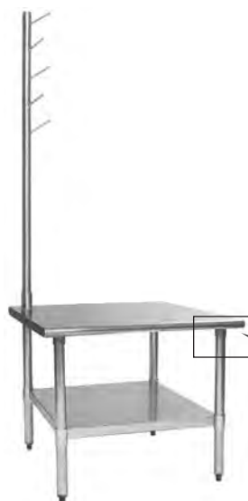
mixer stand shown with optional utensil rack

Eagle Utensil Rack, model UR-501, for mixer stands. 1½"-diameter stainless steel rod with five ⅝" stainless steel rods, approximately 5" long, for utensils. Note: unit is factory installed.