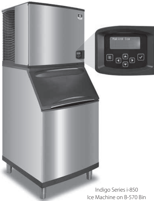
Indigo Series i-850 Ice Machine on B-570 Bin

Designed for operators who know that ice is critical to their business, the Indigo™ Series ice machine's preventative diagnostics continually monitor itself for reliable ice production. Improvements in cleanability and programmability make your ice machine easy to own and less expensive to operate.