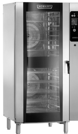
CE20HD shown with standard TTI-20H